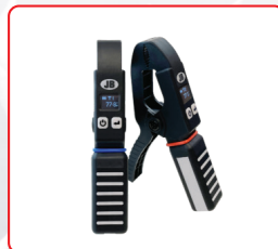
WIRELESS TEMPERATURE CLAMPS