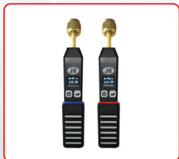
WIRELESS PRESSURE PROBE SET