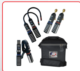
WIRELESS TOOL KITS